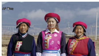
Face Detection AF

This feature is important especially in more demanding 4K shooting applications, such as recording interviews or lectures, helping a specific person subjects automatically stay in pin-sharp focus.